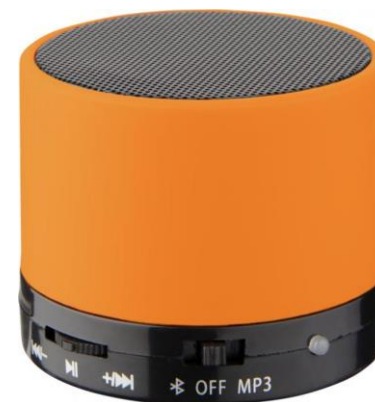
BLUETOOTH SPEAKER (PRINTED) FROM £5.49 EACH