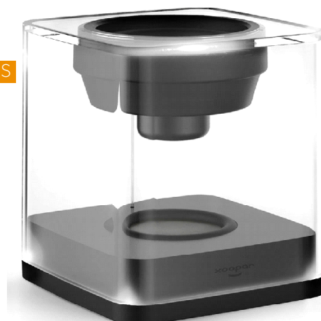
XOOPAR iLO WIRELESS SPEAKER (PRINTED) FROM £24.85 EACH