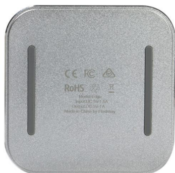
WIRELESS CHARGING MAT (PRINTED) FROM £6.50 EACH