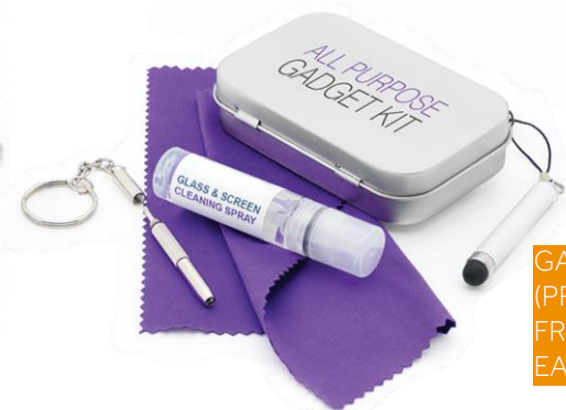
GADGET KIT (PRINTED) FROM £5.44 EACH