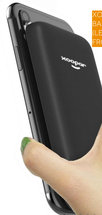
XOOPAR BUBBLE BANG CHARGER (LED ENGRAVED) FROM £21.48 EACH