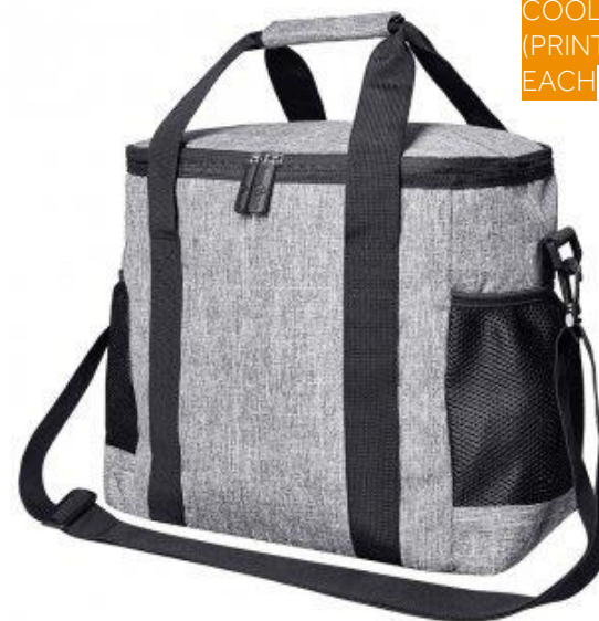
COOLER PICNIC BAG (PRINTED) FROM £12.00 EACH