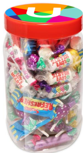
RETRO SWEET JAR (PRINTED) FROM £10.50 EACH