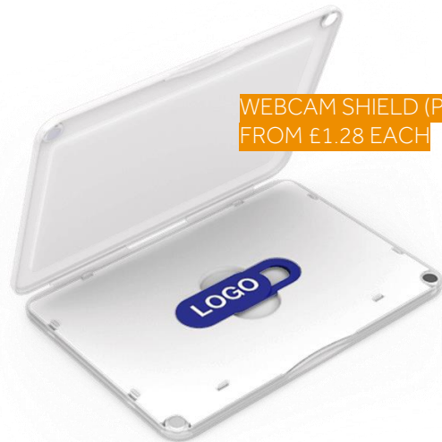
WEBCAM SHIELD (PRINTED) FROM £1.28 EACH