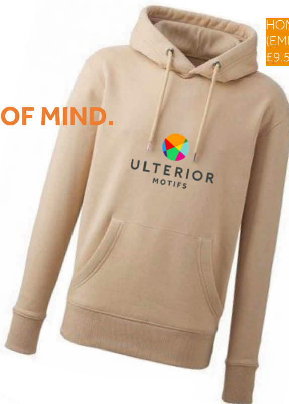
HOME LOUNGING HOODIE (EMBROIDERED) FROM £9.50 EACH

Whether it's something to lounge around in, something to blast the tunes out of or a weekend of reminiscing with a jar of retro sweets, your colleagues will love a branded freebie arriving on their doorstep. Something to tell them that they are being thought of whilst they are not in the office. A bit of branding will never go amiss in the home office either.