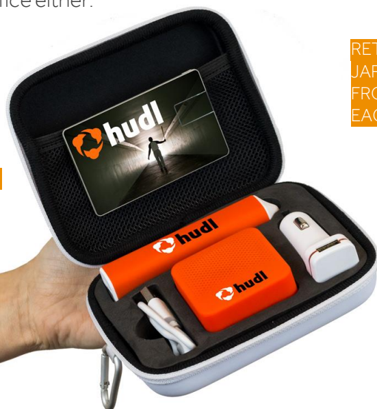
FOUR PIECE POWER PACK (PRINTED) FROM £21.00 EACH