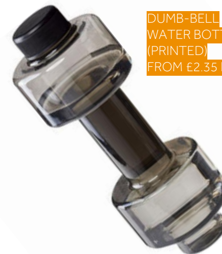
DUMB-BELL WATER BOTTLE (PRINTED) FROM £2.35 EACH