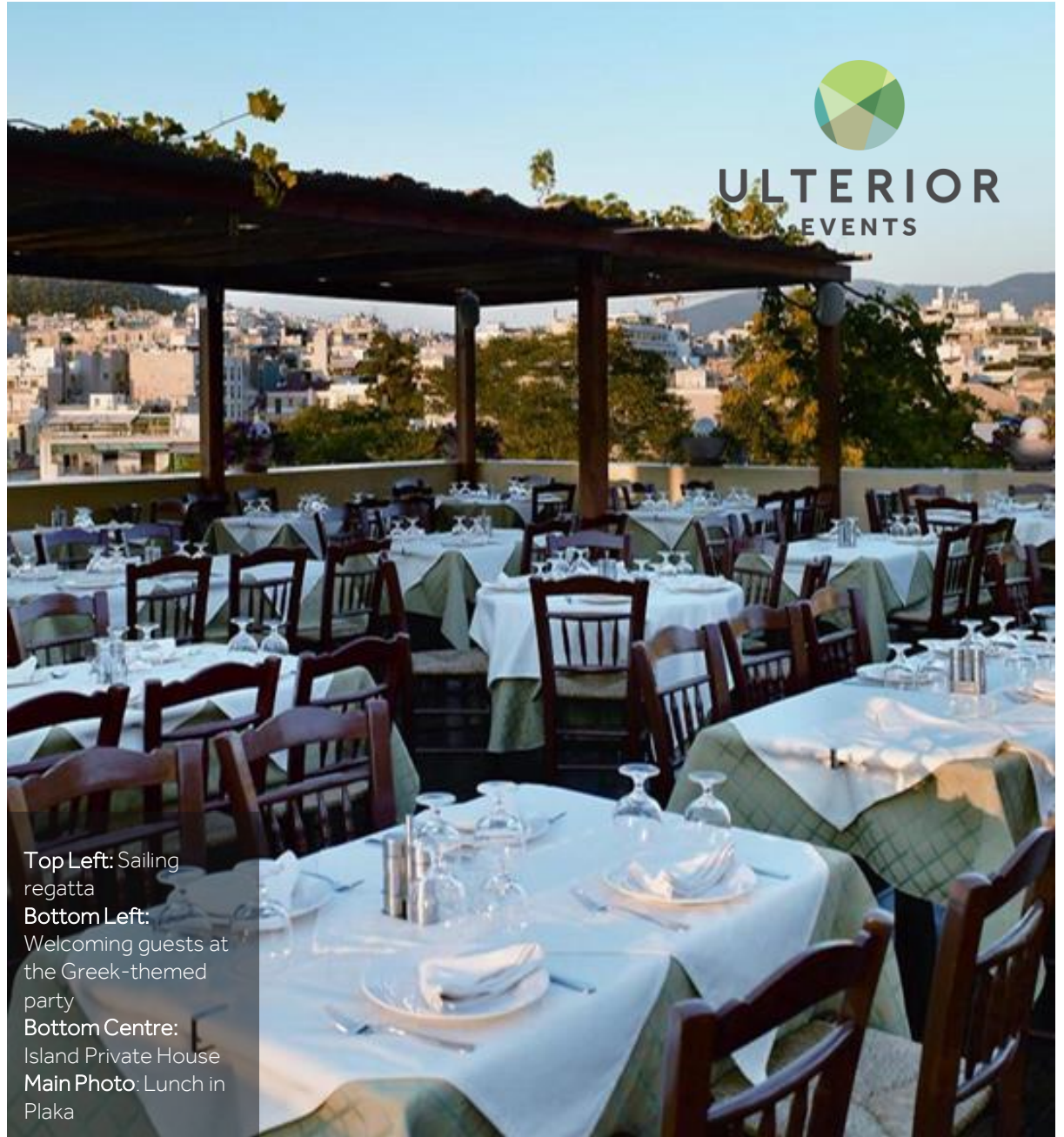
Top Left: Sailing regatta Bottom Left: Welcoming guests at the Greek-themed party Bottom Centre: Island Private House Main Photo: Lunch in Plaka