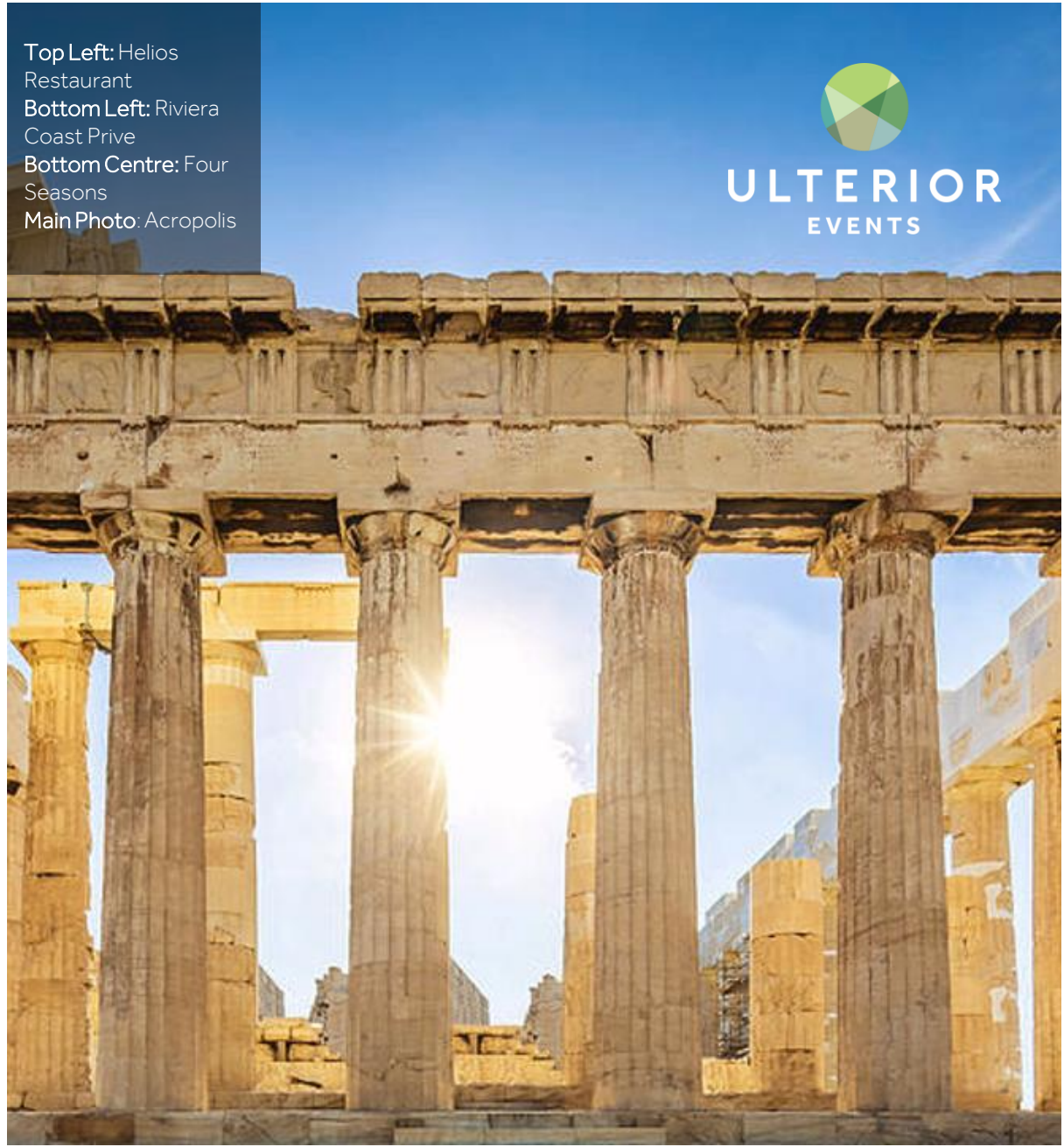
Top Left: Helios Restaurant Bottom Left: Riviera Coast Prive Bottom Centre: Four Seasons Main Photo: Acropolis