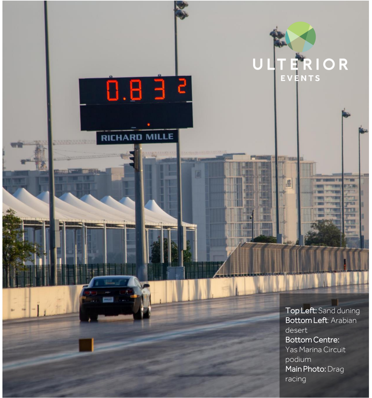
Top Left: Sand duning Bottom Left: Arabian desert Bottom Centre: Yas Marina Circuit podium Main Photo: Drag racing