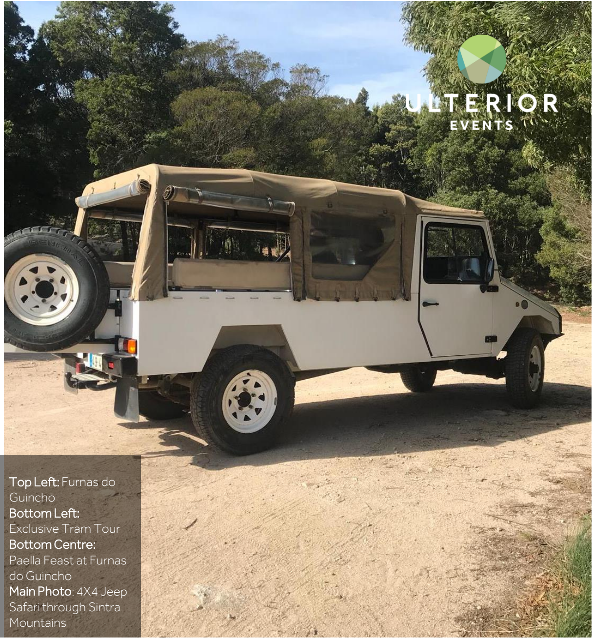
Top Left: Furnas do Guincho Bottom Left: Exclusive Tram Tour Bottom Centre: Paella Feast at Furnas do Guincho Main Photo: 4X4 Jeep Safari through Sintra Mountains