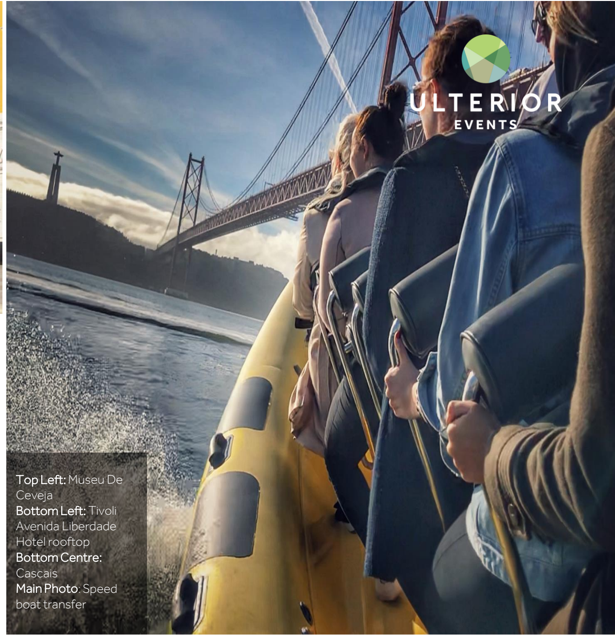
Top Left: Museu De Ceveja Bottom Left: Tivoli Avenida Liberdade Hotel rooftop Bottom Centre: Cascais Main Photo: Speed boat transfer