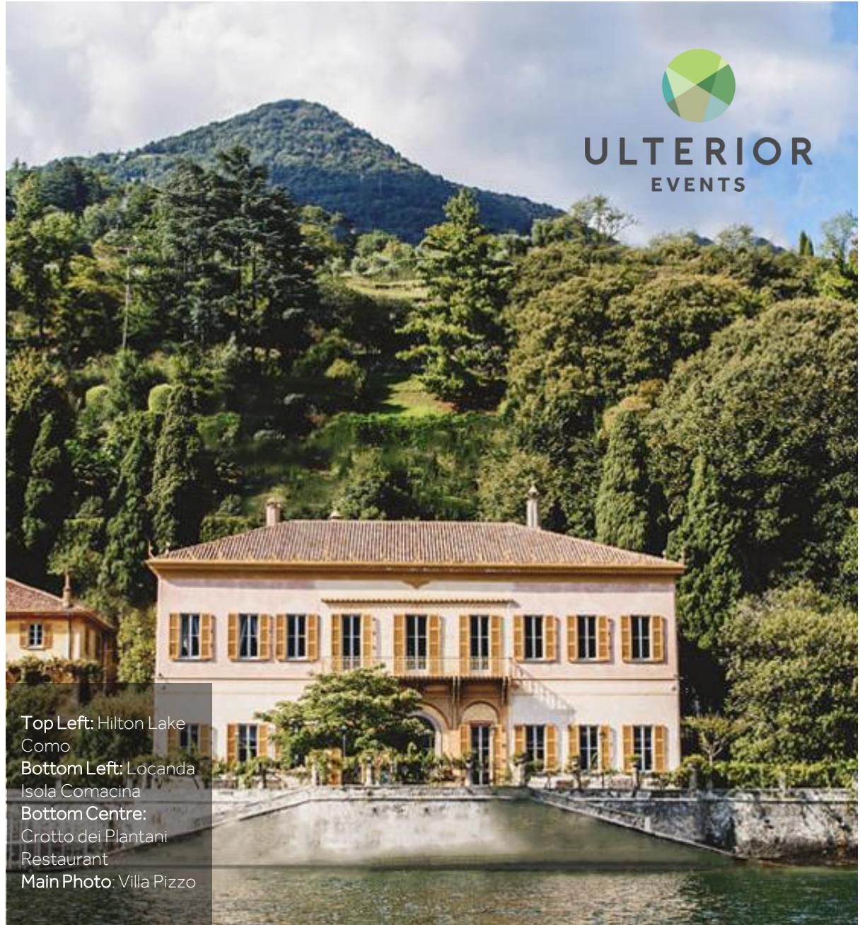
Top Left: Hilton Lake Como Bottom Left: Locanda Isola Comacina Bottom Centre: Crotto dei Plantani Restaurant Main Photo: Villa Pizzo