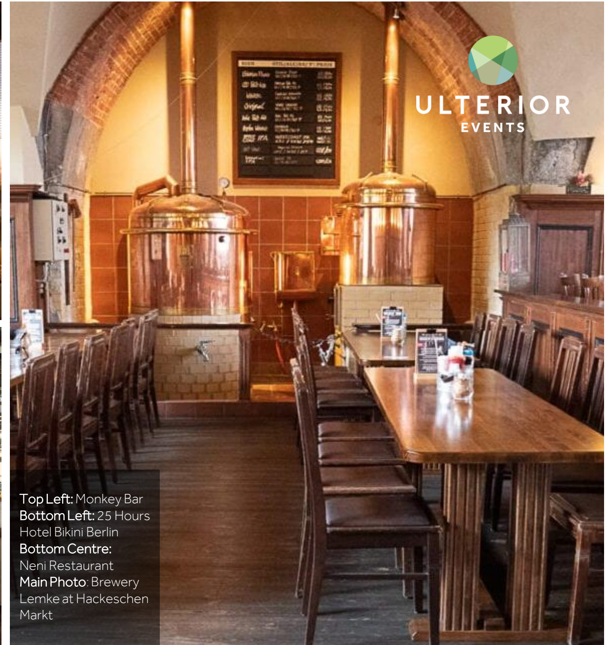
Top Left: Monkey Bar Bottom Left: 25 Hours Hotel Bikini Berlin Bottom Centre: Neni Restaurant Main Photo: Brewery Lemke at Hackeschen Markt