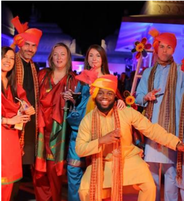
Top Left: Fairmont Jaipur rooftop Bottom Left: Fairmont Jaipur Bottom Centre: Bollywood Gala night Main Photo: Group at The Taj Mahal