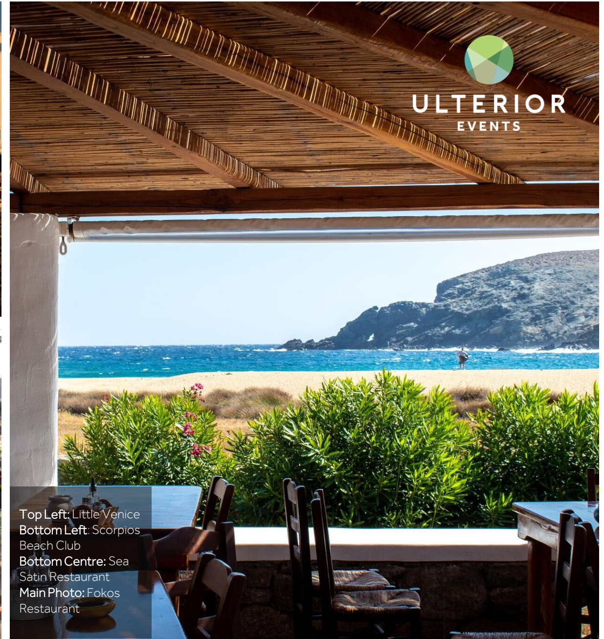
Top Left: Little Venice Bottom Left: Scorpios Beach Club Bottom Centre: Sea Satin Restaurant Main Photo: Fokos Restaurant