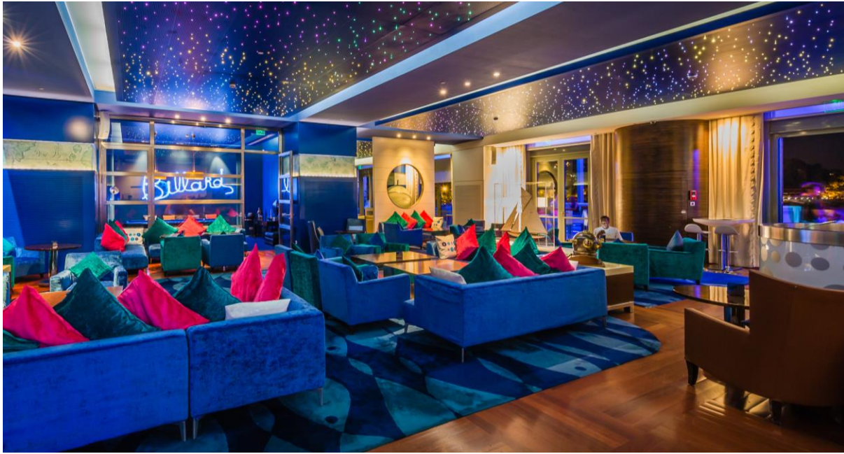
Top Left: Blue Gin Bar Bottom Left: Speedboats Bottom Centre: Casino Square Main Photo: Monte Carlo Bay Hotel