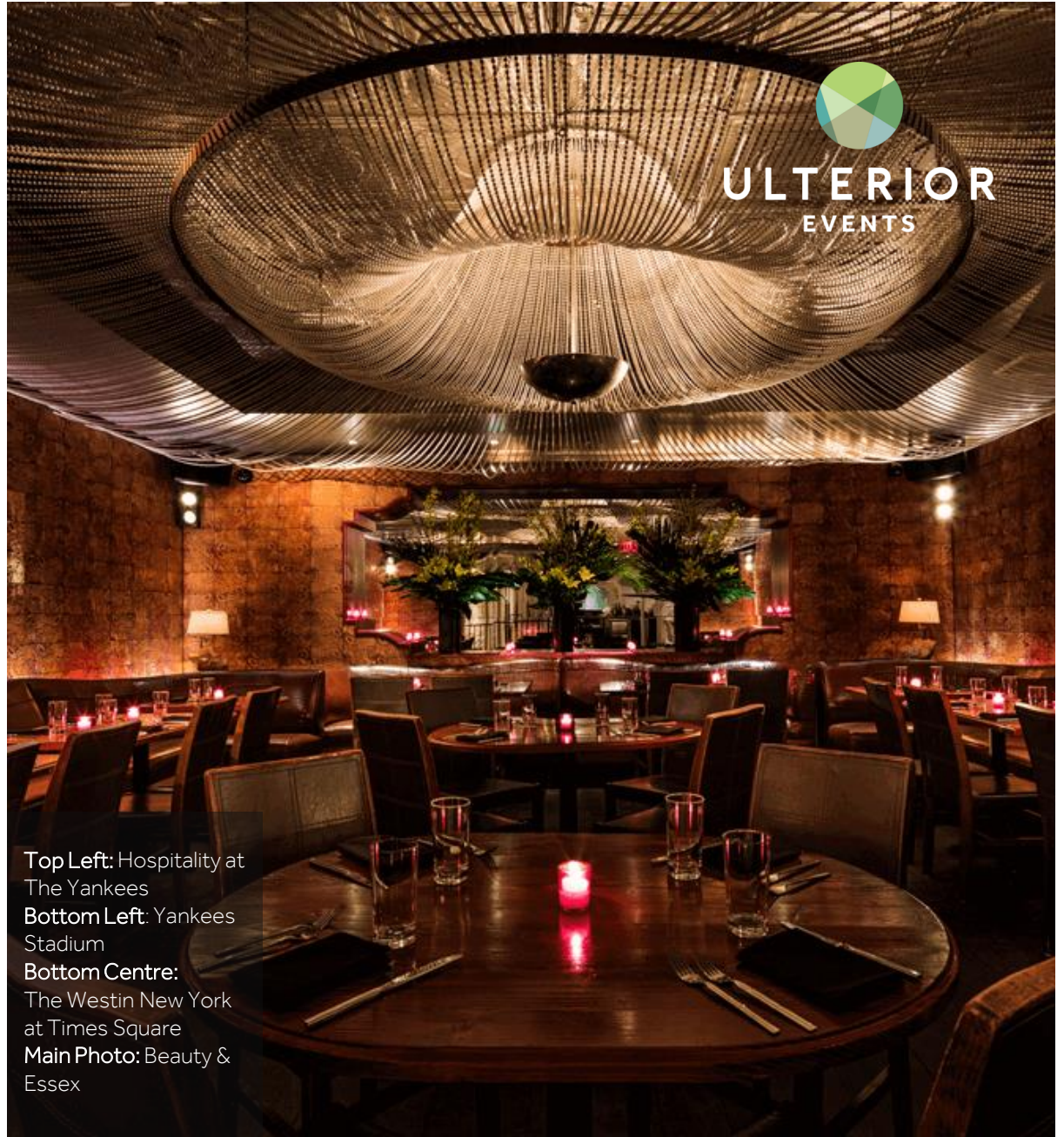
Top Left: Hospitality at The Yankees Bottom Left: Yankees Stadium Bottom Centre: The Westin New York at Times Square Main Photo: Beauty & Essex