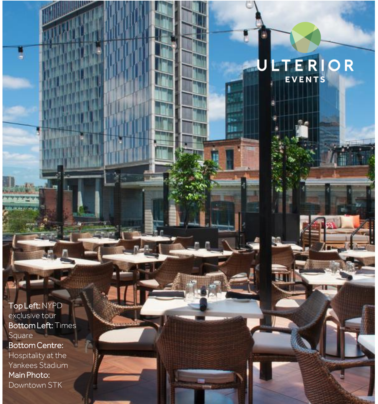
Top Left: NYPD exclusive tour Bottom Left: Times Square Bottom Centre: Hospitality at the Yankees Stadium Main Photo: Downtown STK