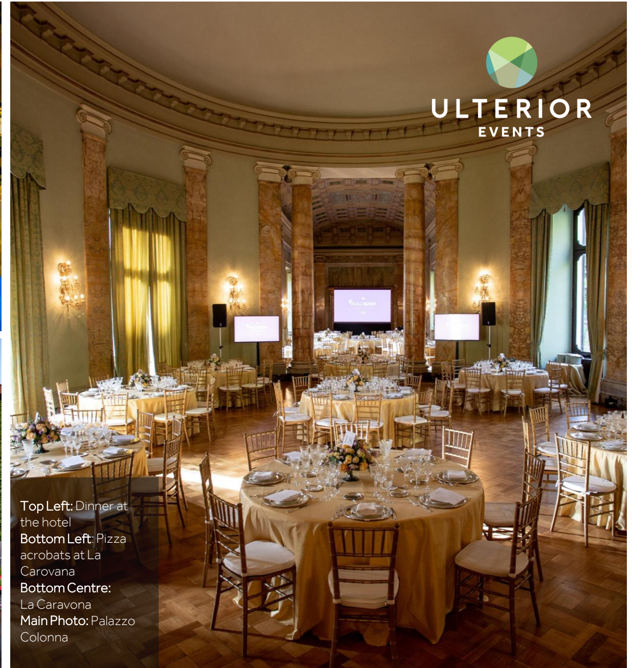
Top Left: Dinner at the hotel Bottom Left: Pizza acrobats at La Carovana Bottom Centre: La Caravona Main Photo: Palazzo Colonna