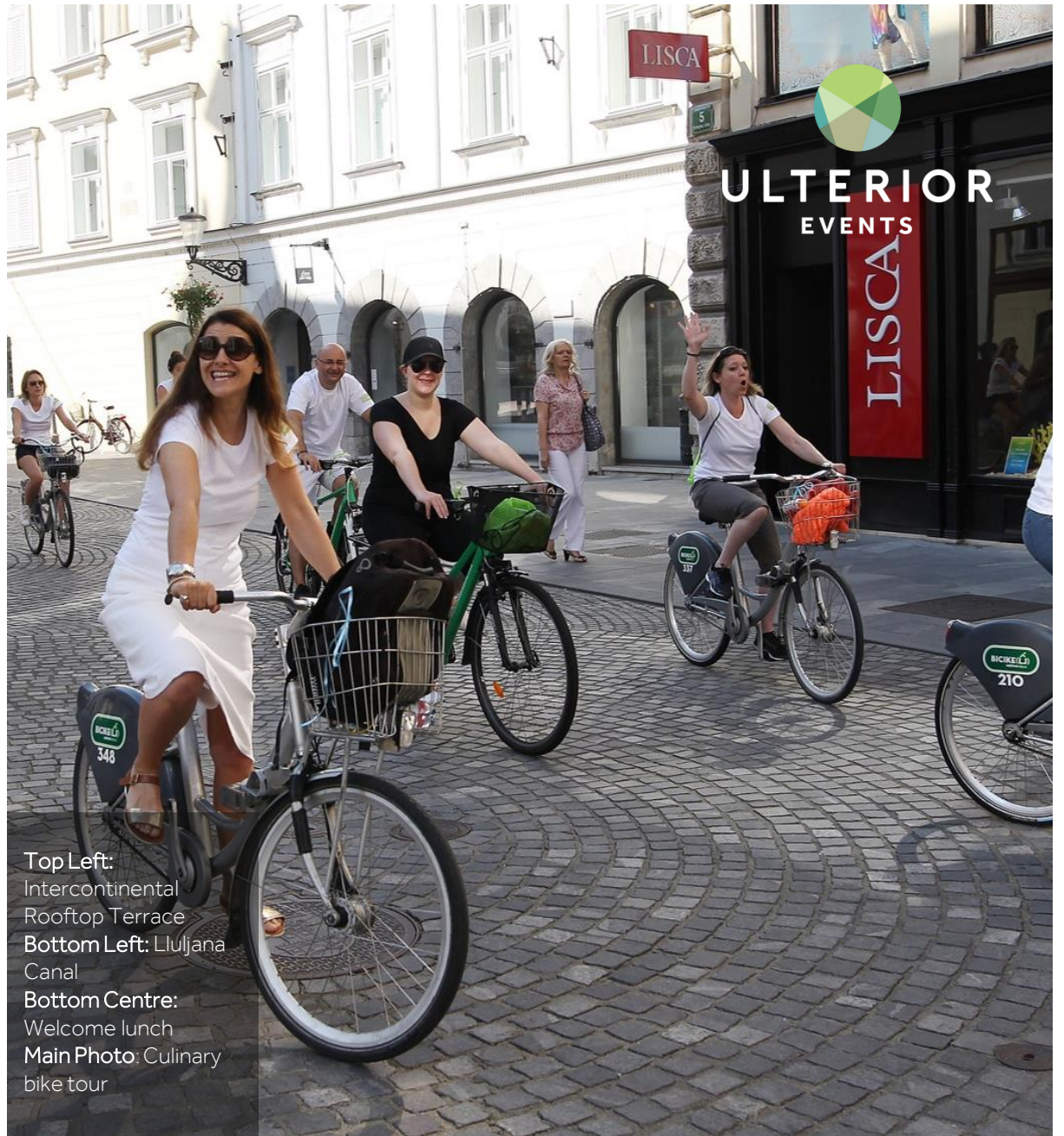
Top Left: Intercontinental Rooftop Terrace Bottom Left: Ljubljana Canal Bottom Centre: Welcome lunch Main Photo: Culinary bike tour